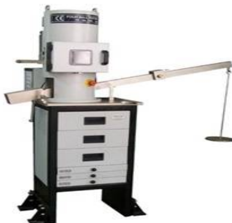
Figure 1: Four Ball Tester