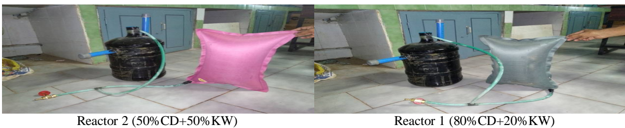
Figure 1: Experimental set up

range of 6.5 to 8.0, In this study, Using Sodium bicarbonate ( \text{NaHCO}_3 ), pH was maintained within the range. The daily variation in temperature and pH was measured in the lab. The study of biogas production was carried out for 28 days. The production of gas was made to collect in the pouch which was connected to the digester and the measurement of biogas production was carried out in the Environmental Engineering Laboratory of the Civil Engineering Department, Rao Bahadur Y. Mahabaleswarappa Engineering College Bellari.