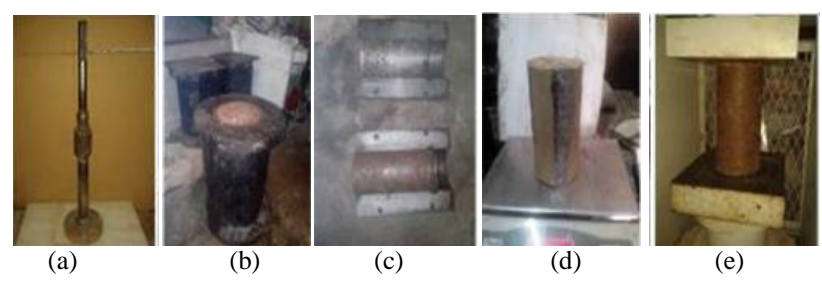
Fig. 1. Sequences involved in preparation and testing of cylinder specimens (a) Tamper used for compaction of cylindrical specimens, (b) Cylindrical mould of 102 mm diameter and 203 mm height used for compaction, (c) Removal of specimen from the mould after 24 hours, (d) Weighing of specimen after proper sealing, (e) Curing of specimens in the BOD incubator at a constant temperature 23.7 °C

(A High Impact Factor, Monthly, Peer Reviewed Journal) Visit: <u>www.ijirset.com</u> Vol. 7, Issue 5, May 2018