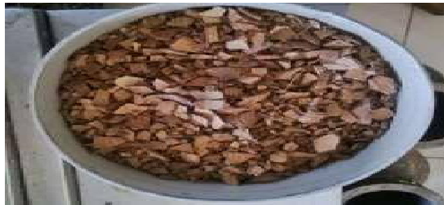
Fig1.coconut shell and coconut shell aggregate