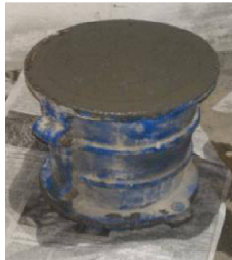
Fig5.Moulding of cube and cylinder