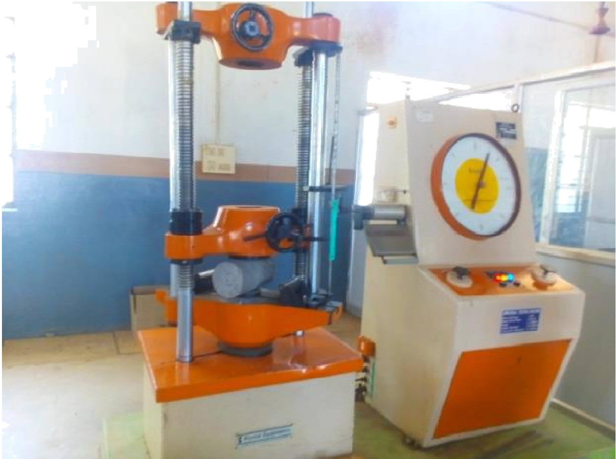
Fig9. Testing of cylinders