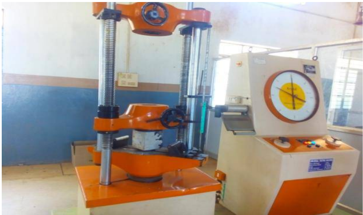
Fig8. Testing of cubes