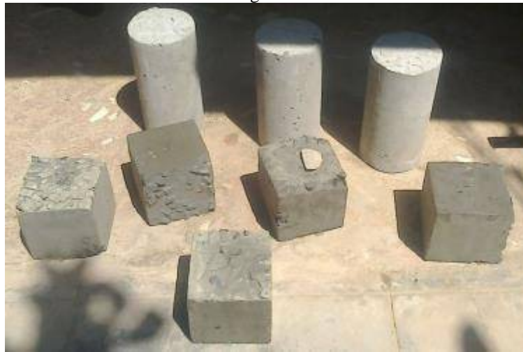
Fig6.De-moulded cube and cylinder

The specimen will be de-moulded after 24 hours of casting.