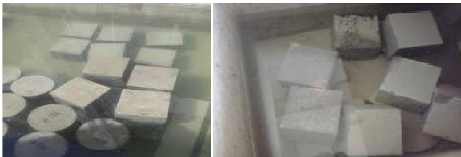
Fig7. Curing of Cubes and cylinders

After demoulding, the specimen will be cured for 28 days. Compressive strength will be calculated in 7 days, 14 days and 28 days. Split tension test will be tested after 28 days of curing of concrete.