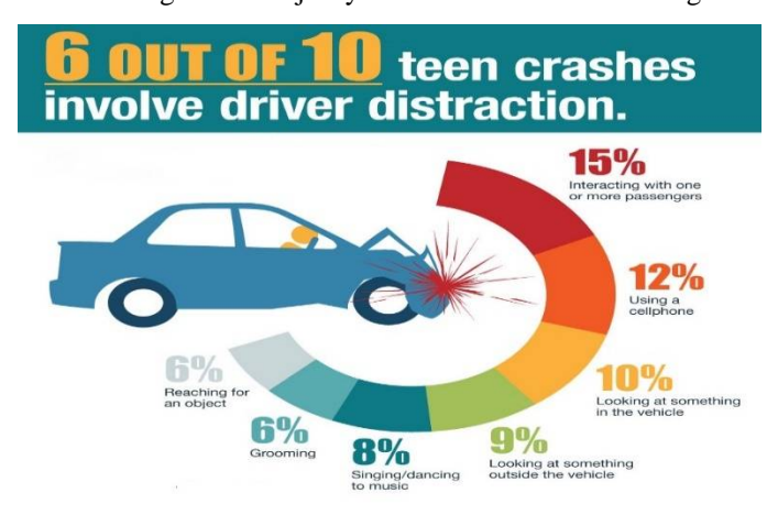
Fig 6: - Reasons for Crashes due to distraction

The safety factor while driving an automobile is something that cannot go neglected. It is one of the key feature that can cause or prevent a catastrophe. Even though all the standard or elite class automobiles has been equipped all the latest available technologies that increases the chances of driving safety, statistics tells a different story. As per "accident attorney" website, the major form of distraction is texting, talking to co passenger, high volume music, alcohol etc. And what is more concerning is that majority of them are caused in teenagers.