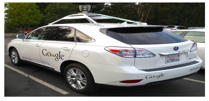
Fig 8: - Autonomous car under development by Google

The thought behind driverless cars was around from the 1970s, so it is not entirely new. AI powered cars, depicted in movies over the years, have always captured our imaginations. But the lack of technical brilliance and resources probably kept it from becoming a reality, until recently. Eventually, all the factors leading to artificial intelligence shaped up and now driverless cars have become a reality. Well, almost, it is just a matter of time before you begin to see real intelligence in them. The idea is to empower the vehicle to act like a human driver and drive through various circumstances. This may sound easy, but is in no way a simple task because a lot of careful computing is required. Through techniques like sensor fusion and deep learning, researchers could develop a technology that would help build a three-dimensional map of all the activities that happen around the car. Some of the leading tech and automotive giants like Google and Tesla are spending millions of dollars in research to come up with better technology and to make autonomous cars a commercial reality.