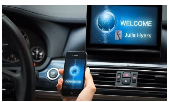
Fig 13: - Infotainment system connected to the automobiles through Wi-Fi