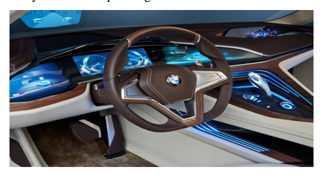
Fig 12: - BMW harnessing the cognitive abilities of IBM Watson

The driverless revolution will continue to cruise along the streets, and you will be witness to not just small cars with AI capabilities, but huge 18-wheel trucks carrying an assortment of goods as well. This is taken a step further with cognitive analysis that kind of imitates the human behavior by looking at the behavior patterns and data mining capabilities. Cognitive systems are supposed to work just like a human would interpret a real-life situation, and to do that, a deeper understanding of unstructured data is essential. Insights would be drawn from plenty of unstructured data to decide on how to respond naturally in real time. Cognitive capabilities would be able to handle dynamic operating conditions as well. Car manufacturers have already started incorporating this into their vehicles.