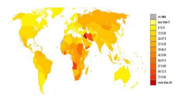
Fig 4: - Road Fatalities per Capital (WHO)