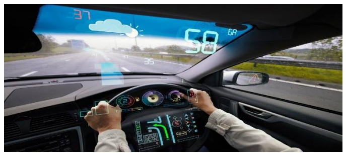
Fig 11: - Internet of Things utilized in an automobile