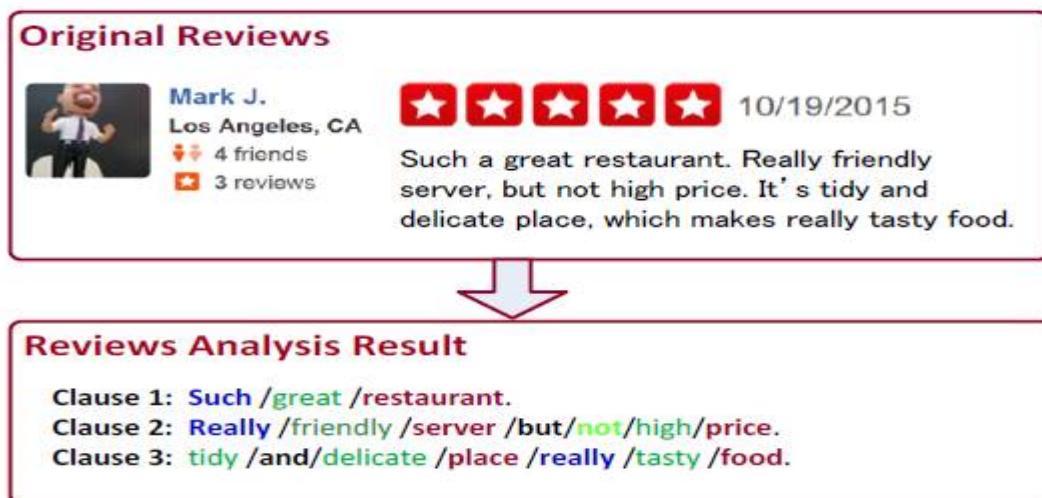
Fig.3. An example of review analysis for identifying user’s sentiment on Yelp.