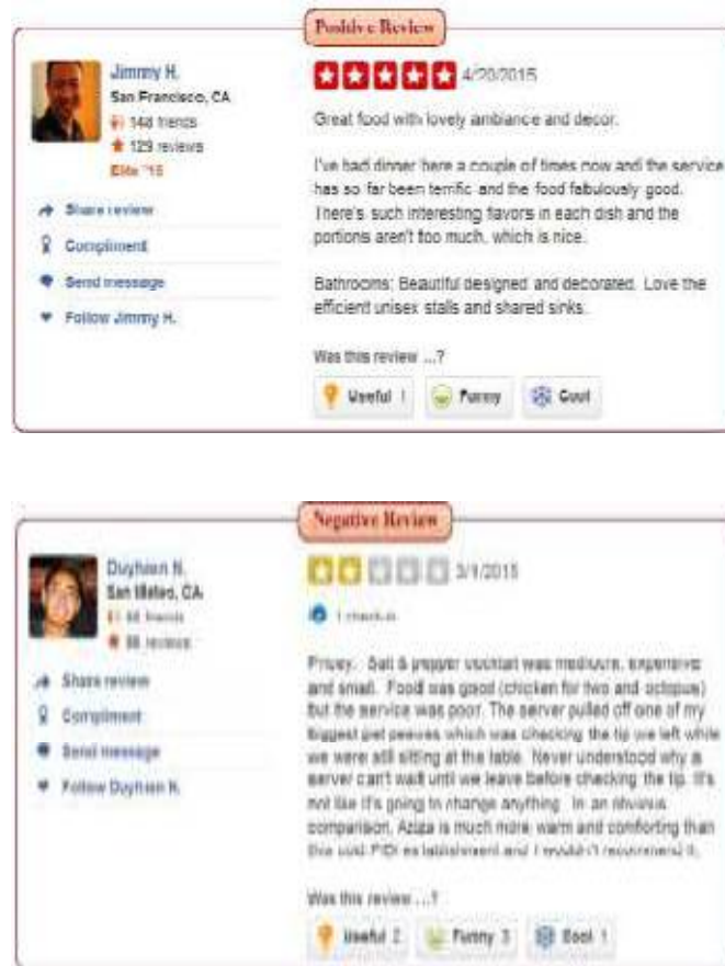
Fig. 1. An example of positive review and negative review on websites.

To avoid these problems [6] propose a sentiment-based rating prediction method in the framework of matrix factorization. Fig (2) illustrates our motivation. Here extracting product features from reviews. Then find out the sentiment words and with these word constructing a sentiment dictionary. Here combine social friend circle to recommend. In fig (2) the last user is interested in the last item based on the sentimental dictionary. Compared with previous work [3-5], the main difference is using unstructured information instead of structured social factors. Compared with [9],[10] the main difference is it classifying users into binary sentiment and do not go further mining. In this consider user's sentiment but also explore interpersonal sentimental influence and item reputation. Finally fuse all of them in to a recommender system.