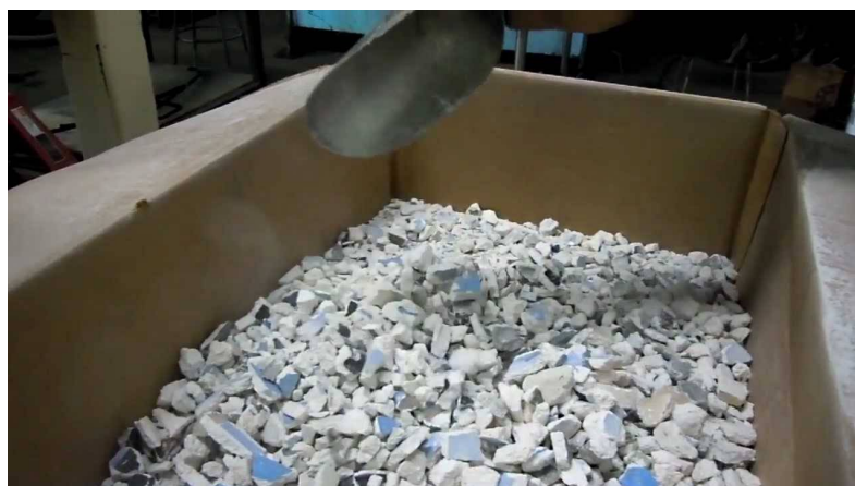
Fig2. Waste ceramic tiles

Table 3.7 shows the various physical properties such as specific gravity, fineness modulus and impact value of waste ceramic tiles.