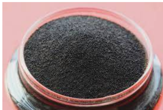
Fig1. Waste foundry sand

Table 3.5 shows the chemical composition of waste foundry sand. Waste foundry sand has low absorption and is nonplastic. Reported values of absorption were found to vary widely, which can also be attributed to the presence of binders and additives. The content of organic impurities can vary widely and can be quite high. This may preclude its use in applications where organic impurities could be important (e.g., Portland cement concrete aggregate). This variability has been attributed to the variability in fines and additive contents in different samples. In general, foundry sands are dry, with moisture contents less than 2 percent.