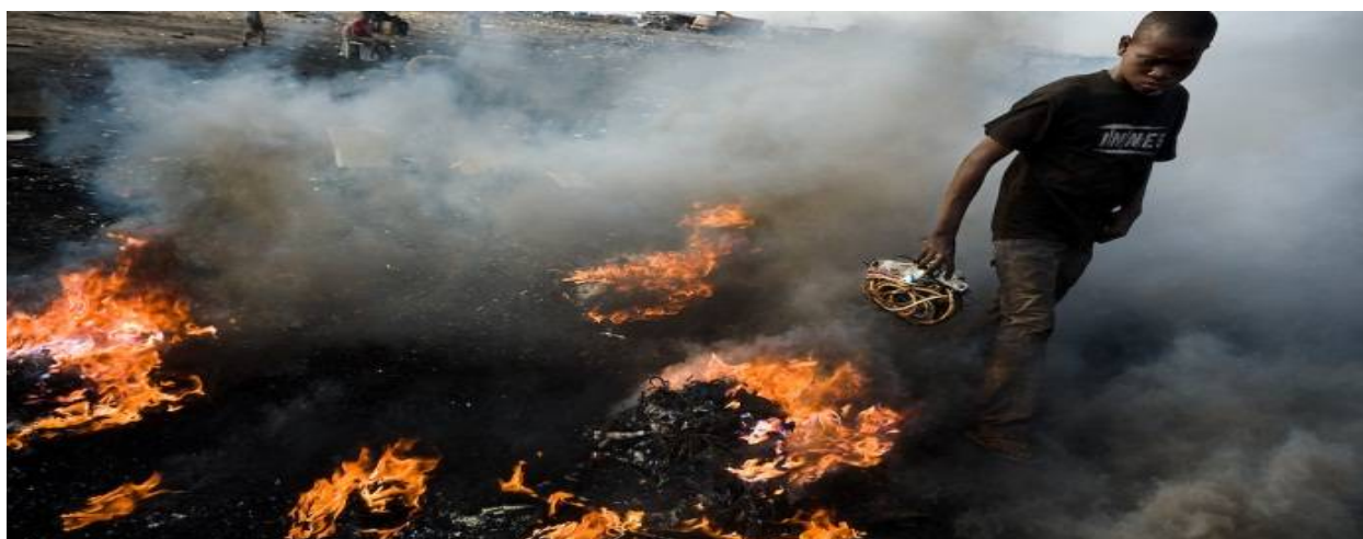
Fig.2 Burning of electronic device for extracting of metals.

Effects on air- One of the most common effect of E-waste on air is through air pollution. For example, a British documentary about Lagos and its inhabitants, called Welcome to Lagos, shows a number of landfill scavengers who go through numerous landfills in Lagos looking for improperly disposed electronics which includes wires, blenders, etc., to make some income from the recycling of these wastes. These men were shown to burn wires to get the copper (a very valuable commodity) in them by open air burning which can release hydrocarbons into the air.