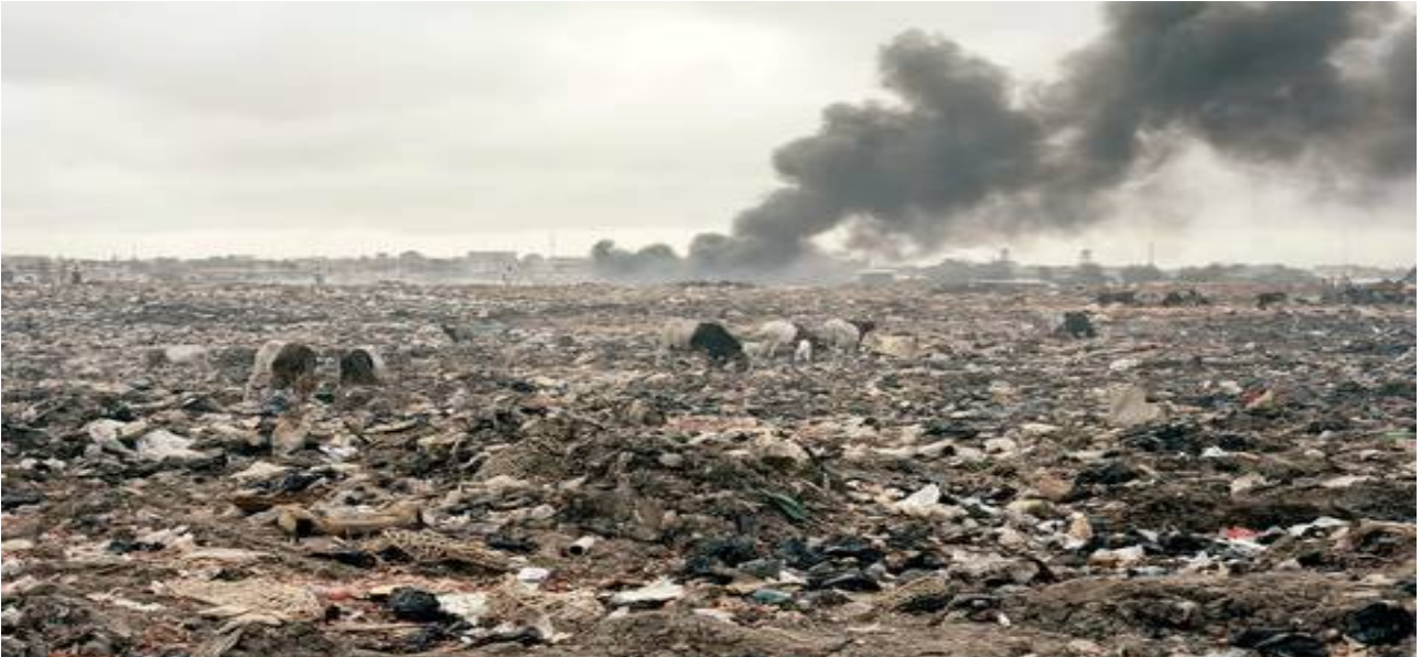
Fig.4 Because of Heavy metals leach through the soil and burning of electronic device soil loss its fertility.