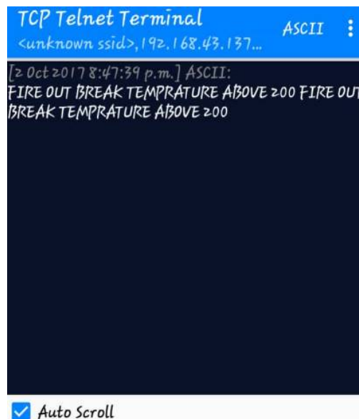
Fig 8.1 output of fire alerting system