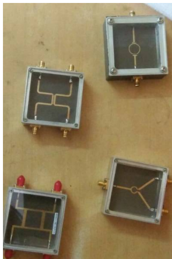
Fig 4: Microstrip elements

Thus the antennas are very much important in communication. In mobiles there are almost two or three antennas. Everyone has its own purpose. One for Bluetooth, other for Wi-fi, and other for transmitting, and another one for both transmit and receive etc.. The antennas that are been manufactured are dipole antenna, monopole antenna, patch antenna in which there are some types again, yagiuda antenna, horn antenna, array antenna, smart antenna etc.. The other components have also been designed using the microstrip methodology.