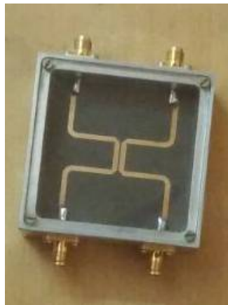
Fig 3: Microstrip branch line coupler