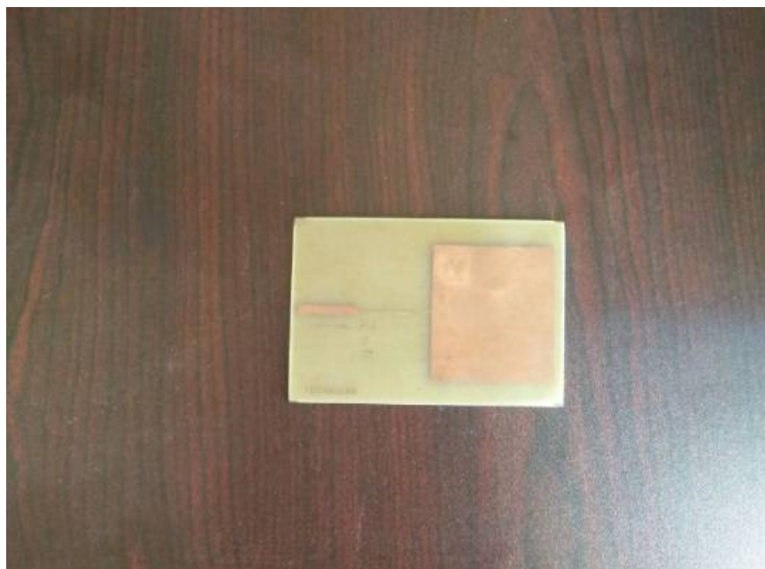
Fig 2: Microstrip Monopole antenna