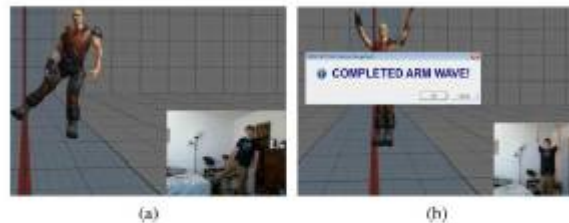
(a) Three-dimensional reconstruction of "right leg rise." (b) Three-dimensional reconstruction of "arm wave."