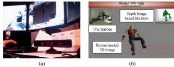
(a) Kinect-based image capture system. (b) Three-dimensional reconstruction GUI.