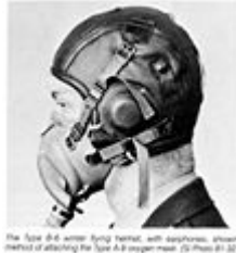
Fig 2 B-6 winter flying helmet with A-9 oxygen mask, WW2 vintage