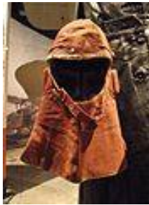
Fig 1 British leather flying helmet from 1918