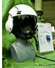
Fig 5 Gentex SPH-5 helicopter helmet