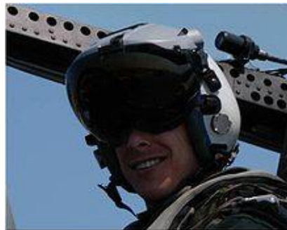
Fig 10 JHMCS

JHMCS is a derivative of the DASH III and the Kaiser Agile Eye HMDs, and was developed by Vision Systems International (VSI), a joint venture company formed by Rockwell Collins and Elbit (Kaiser Electronics is now owned by Rockwell Collins). Boeing integrated the system into the F/A-18 and began low-rate initial production delivery in fiscal year 2002. JHMCS is employed in the F/A-18A++/C/D/E/F, F-15C/D/E, and F-16 Block 40/50 with a design that is 95% common to all platforms.