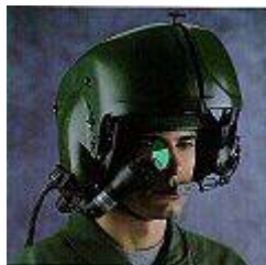
Fig 4 Modern US Army Apache helmet