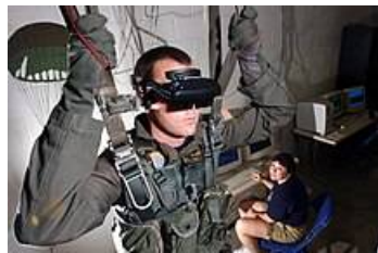
Fig 6 Paratrooper training with an HMD

A key application for HMDs is training and simulation, allowing to virtually place a trainee in a situation that is either too expensive or too dangerous to replicate in real-life. Training with HMDs covers a wide range of applications from driving, welding and spray painting, flight and vehicle simulators, dismounted soldier training, medical procedure training, and more. However, a number of unwanted symptoms have been caused by prolonged use of certain types of head-mounted displays, and these issues must be resolved before optimal training and simulation is feasible.