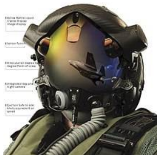
Fig 11 Helmet-Mounted Display System for the F-35 Lightning II Joint Strike Fighter

Vision Systems International (VSI; the Elbit Systems/Rockwell Collins joint venture) along with Helmet Integrated Systems, Ltd. developed the Helmet-Mounted Display System (HMDS) for the F-35 Joint Strike Fighter aircraft. In addition to standard HMD capabilities offered by other systems, HMDS fully utilizes the advanced avionics architecture of the F-35 and provides the pilot video with imagery in day or night conditions. Consequently, the F-35 is the first tactical fighter jet in 50 years to fly without a HUD. A BAE Systems helmet was considered when HMDS development was experiencing significant problems, but these issues were eventually worked out. The Helmet-Mounted Display System was fully operational and ready for delivery in July 2014.