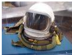
Fig 3 Soviet MiG-25 pilot helmet of the 1980s