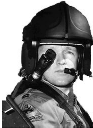
Fig 9 IHADSS

In 1988 the U.S. Army fielded the AH-64 Apache and with it the Integrated Helmet and Display Sighting System (IHADSS), a new helmet concept in which the role of the helmet was expanded to provide a visually coupled interface between the aviator and the aircraft. The Honeywell M142 IHADSS is fitted with a 40° by 30° field of view, video-with-symbolology monocular display. IR emitters allow a slewable thermographic camera sensor, mounted on the nose of the aircraft, to be slaved to the aviator's head movements. The display also enables Nap-of-the-earth night navigation. IHADSS is also used on the Italian Agusta A129 Mangusta.