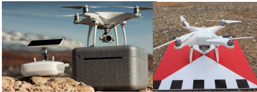
Fig. 1. Used unmanned aerial vehicle

(Figure 1). Studies carried out with the help of UAVs catch up with the terrestrial photogrammetry in terms of precision and can be applied in many different areas, as UAVs can complete work in a short period of time [10]. Many researchers have used unmanned aerial vehicles effectively in various areas and obtained positive results, including Niethammer et al. (2009) in the field of monitoring and obtaining high-resolution images of landslides, Wing et al. (2014) in the mapping of surfaces of forest lands, Döner et al. (2014) in the use of UAV images for mapping studies, Mases et al. (2015) in the use of UAVs for communication purposes in large-scale disaster studies, Akgül et al. (2016) in generating a high-precision numerical elevation model and its use in forestry areas, and Yakar and Mirdan (2017) in the modeling of historical monuments. In Figure 2 below, the distribution of 1000 UAV applications carried out between 2015 and 2016 are given according to their purposes. As the figure shows, a great deal of the applications carried out in recent years by using UAVs have gathered in areas such as aerial photography, aerial survey, aerial inspection and agriculture. For this reason, it is important and necessary to know and reveal the risks of applications of UAVs which have found so many areas of use in addition to military applications.