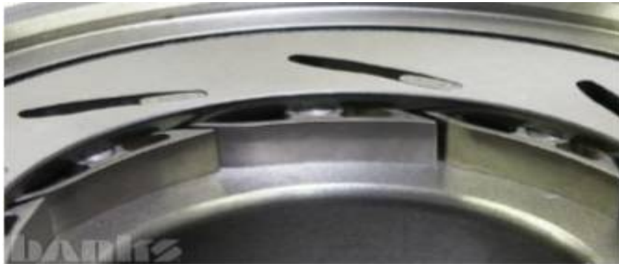
Fig.5. Vanes Closed

Above figure shows that how the vanes look when they are closed, depending on engine RPM the vanes of VGT Closed