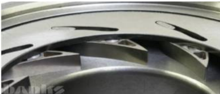
Fig.4. Vanes Open

A turbocharger equipped with Variable Turbine Geometry has little movable vanes which can direct exhaust flow onto the turbine blades. The vane angles are adjusted via an actuator. The angle of the vanes varies throughout the engine RPM range to optimize turbine behaviour.