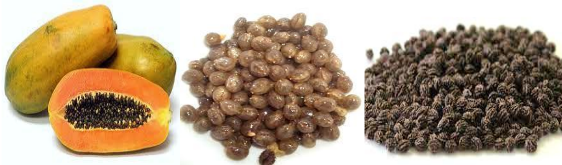
Figure 1. Carica papaya L. fruit (left), seed (middle) and dry seed (right)