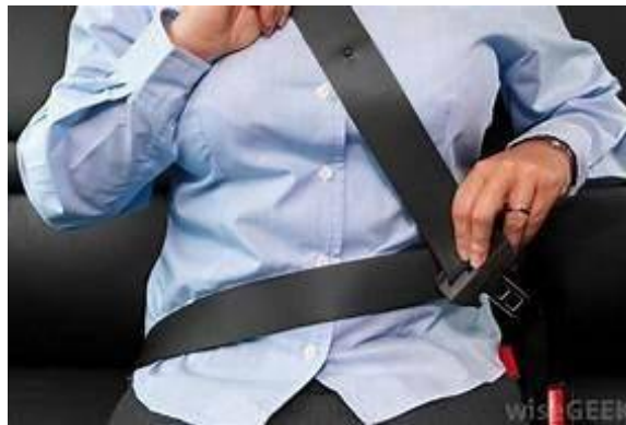
Figure 6 Polyesterfibre uses in seat material

As the fibre of the century, polyester enjoys a wide spectrum of properties like high stress property, excellent features like colorfastness, wear and abrasion, resilience, resistance to heat (during treatments), stiffness, chemical and solvent resistance, etc. Components of automobile like seat covers, headliners, door panels, package trays, tyres and safety belts are wholly made from polyester. Majority of fabrics employed in automobile interiors are made from polyester alone than any other fibre. It is also interesting to note that the polyester used in seat, door panel, etc is recyclable in nature. A report says that nearly 45% of the polyester is used as floor covering and 25% as seat cover in automotive market. Compared with nylon, polyester possess several advantages like low cost, less abrasive nature, ease and smaller package formation, etc.[8]