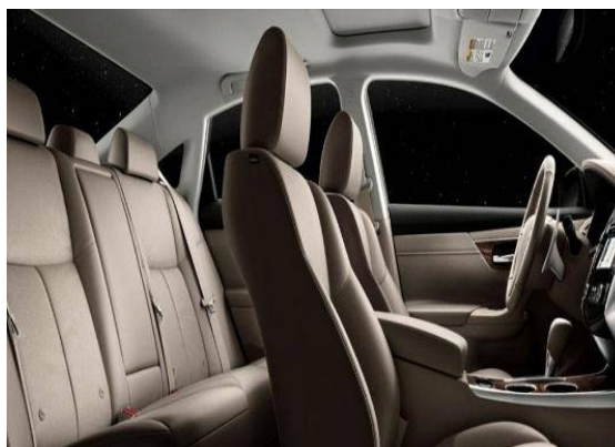
Figure - Polypropylene fibre use in seat material