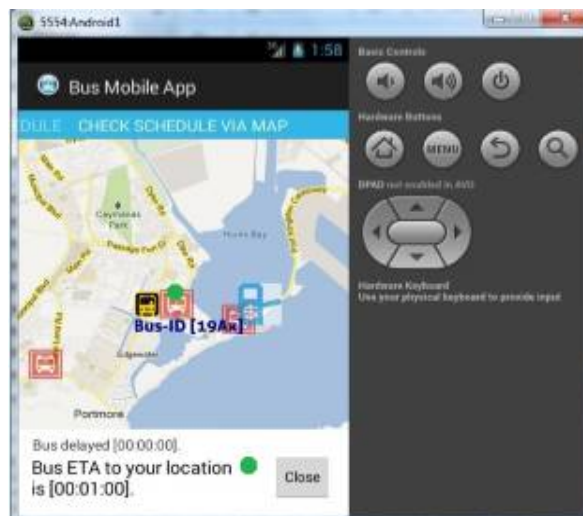
Fig 6: Bus Location and Expected Time of Arrival