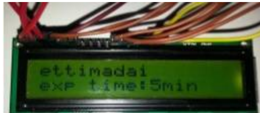
Fig 7: LCD display showing the current position of the bus and expected time