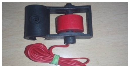
Fig 4 : Fuel Sensor

Basically protected gives a brilliant capacitive sort of fuel sensor. The client simply needs to bolster the limit of the tank and mileage of the vehicle .This gadget is exceptionally savvy and can figure fuel utilization and amount. It will produce an alarm message to the client is any control with your fuel. Fuel robbery control is completed in fact correspondingly to powering control.GPS GPS beacon introduced on transport gets information about changes of fuel level in the tank from fuel level sensor. Proprietor gets a message of the unapproved fuel depleting very quickly. Just protected GPS tracker gadget picks up fuel utilization information straightforwardly from transport fuel sensor so as keep away from the abuse.