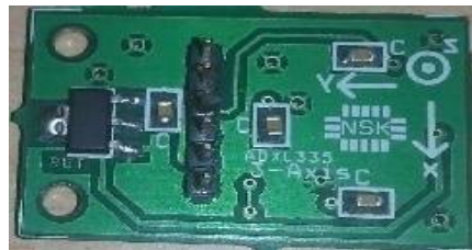
Fig 3: Accelerometer Radiator

The ADXL335 is a little thin low power, finish 3-pivot accelerometer with a solitary molded voltage yields. The item measures speeding up with a base full-scale scope of +3g. It can quantify the static quickening of gravity in detecting applications, and dynamic increasing speed coming about because of movement, stun or vibration. The client chooses the data transmission of the accelerometer utilizing the Cx , Cy, and Cz capacitors at the Xout ,Yout and Zout pins. Transfer speed can be chosen to suit the application, with organize of 0.5Hz to 1600Hz for X and Y pivot and a scope of 0.5 Hz to 550Hz for the Z hub.