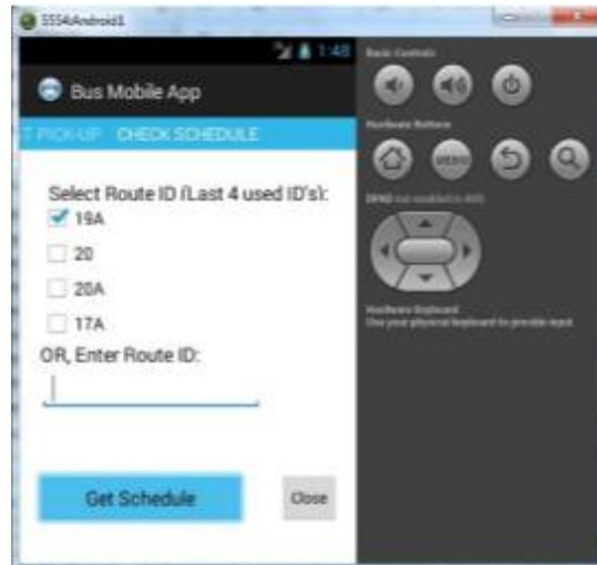
Fig 5: Bus Route Selection