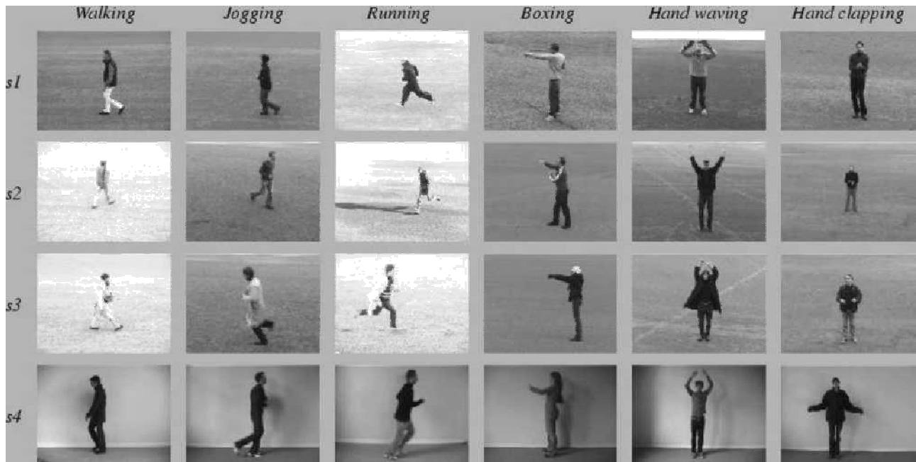
Figure : Data sets for video action recognition.