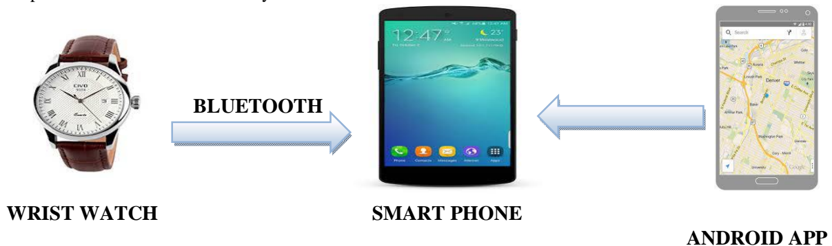
Fig1: Smartphone with application linked to watch

The hardware used in this system consists of an Android smart phone and a Wrist watch. The application is installed on the smart phone and the watch consists of an emergency button. As illustrated in Fig 1 the watch and smartphone are linked together via Bluetooth such that when the emergency button on the watch is triggered the application on the smart phone is turned on automatically and functions.