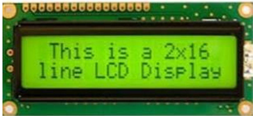
Fig 5 : LCD 16*2

LCD stands for Liquid Crystal Display which is used to display the location of bus. We are using 14 pins LCD which are given below: