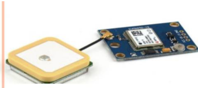
Fig 1:GPS Module

The global positioning system (GPS) is a satellite-based navigation system consists of a network of 24 satellites located into orbit as shown at figure 2. The system provides essential information to military, civil and commercial users around the world and which is freely accessible to anyone with a GPS receiver. GPS works in any weather circumstances at anywhere in the world. Normally no subscription fees or system charges to utilize GPS.