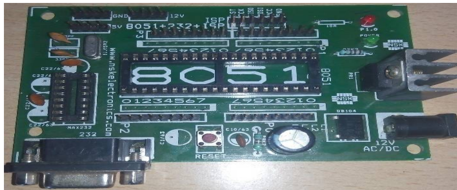
Fig4 : Micro Controller

As we know that a microcontroller is a small computer on a single integrated circuit. In modern technology it is similar to, but less sophisticated than, a system on a chip. The AT89C51 is a low power, high performance COMS 8-bit microcomputer with 4K bytes of Flash programmable and erasable read only memory. It control unit of the entire project. Here we are using a 40 pin IC and the IC Number is SST89E516RD2(Silicon Storage Technology). MAX 232 IC is used to convert RS (register select) to TTL(translator transistor logic). Two types of capacitor are used one is ceramic capacitor of 0.01MF for the purpose of synchronization and other is the electrolyte capacitor of 4.7MF. And overall a 12V power supply is given to it.