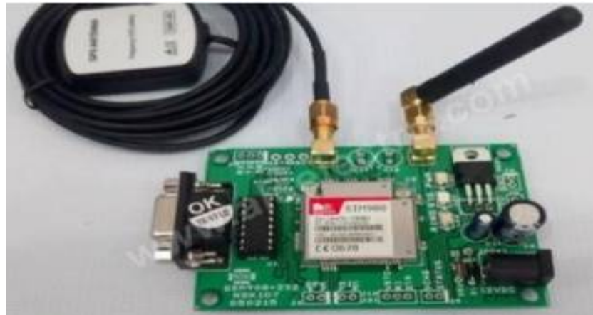
Fig6 : SIM908 GPS/GSM

SIM908 is a Tri-band GSM/GPRS engine that works on frequencies EGSM 900 MHz, DCS 1800 MHz and PCS 1900 MHz. SIM300 features GPRS multi-slot class 10/ class 8 (optional) and supports the GPRS coding schemes CS-1, CS-2, CS-3 and CS-4.