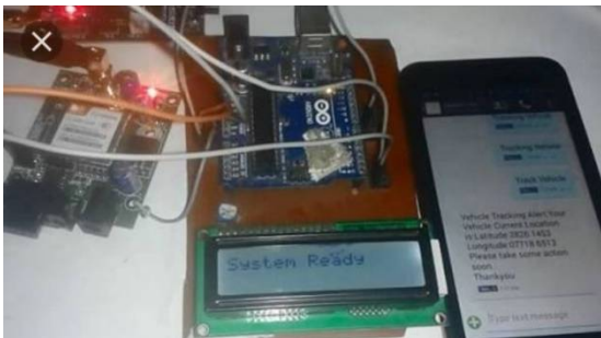
Fig 1: Displaying the command