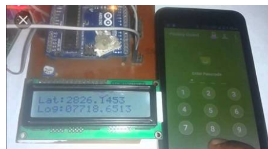
Fig 4: Getting outputs for the actions