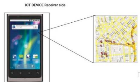
Fig 2: IOT device receiver side