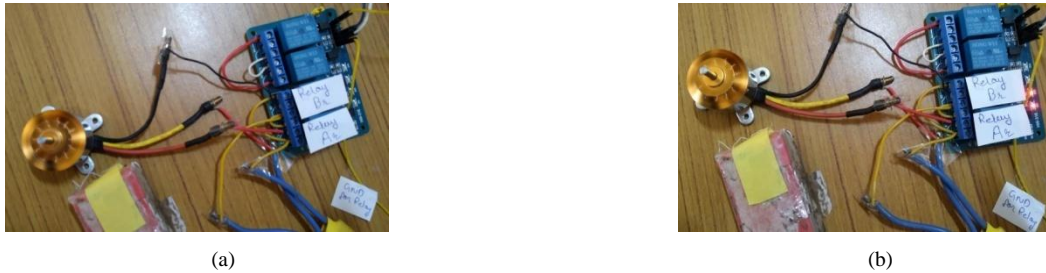
Fig. 4 (a) clockwise direction rotation (b) counter- clockwise direction rotation

Now the solution for contradiction that was observed in the Section II about the decrease in overall performance of the system, it is that the controller can be programmed for certain more functions when the PWM signal value hits the other values of the whole channel. Hence a single channel (here ‘Elevator’) can be used for optimum functions for the remaining values. Here we have considered the electro-mechanical relays for our operation, but according to availability, we can use solid state relays for smoother operation by the trade-off for separate bias circuit.