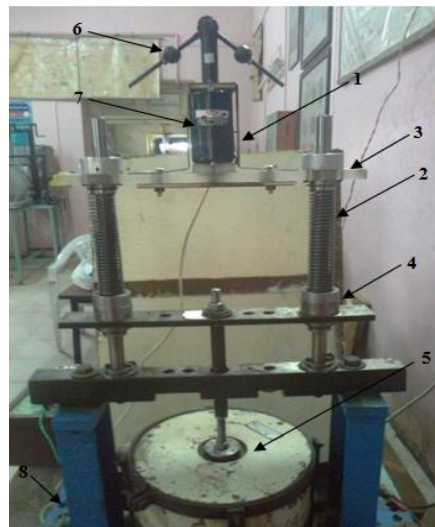
Figure 2: Experimental Set-up.

Figure 2 shows the experimental set-up designed, developed and used for experimental investigation of effectiveness of the developed CPVA for a SDOF vibrating system subjected to harmonic base excitation. The sprung mass M (1) consisting of the mass of the pendulum, pendulum drive D.C. motor (7) and the sliding base (3) supported on two helical springs (2). The suspension springs (2) are supported on a sliding base assembly (4) and the entire system is excited with harmonic excitation at its base (4) by an electro-magnetic vibration exciter (5). The CPVA consisting of a pair of two pendulums with masses m_p/2 (6) each is attached to the shaft of pendulum drive D.C. motor (7). The entire system is mounted on a massive concrete foundation (8). The measurement of experimental values of motion transmissibility ( Mt ) was carried out with the help of FFT analyzer (Multi-purpose data acquisition system) for various values of frequency ratio ( \lambda ) in the neighborhood of natural frequency of the sprung mass system.