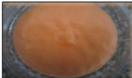
Figure 3. Carrot yoghurt formulated with 20% carrot juice. Sensory and other parameters were found optimal at this concentration of carrot juice.

The acidity of control yoghurt increased during the refrigerated storage after 14 days, this may be due to the fact that the yoghurt starter culture S. thermophilus is active even at refrigerated temperature and still can produce small amounts of lactic acid by fermentation of lactose which results in noticeable pH decrease by Deva et al. [8].Changes in pH of the carrot yoghurt remained almost stable even for up to 14 days (Table 3).