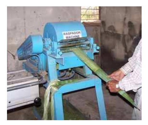
Fig. 2.Mechanical process of sisal fiber extraction using raspadormachine[4]

Sisal fiber can be extracted from its leaves by Retting, Boiling and Mechanical extraction ways. Water retting is a traditional biodegradation process involving microbial decomposition (breaking of the chemical bonds) of sisal leaves, which separates the fiber from the pith. The fibers are washed and processed further. This process takes 15–21 days for a single cycle of extraction and decrease the quality of fiber. Retting is a very slow, water intensive process, unhygienic, and not eco-friendly. Mechanical extraction involves inserting leaves into a machine "raspador machine "and pulling the raw material out as shown in fig.2. This process does not deteriorate fiber quality and is suitable for small-scale operations and is efficient, versatile, cost effective and eco-friendly process. Residues produced during and after extraction of fiber are about 96% which is useful for biogas generation, composting, and isolation of a steroid, ecogenin, making paper, biodegradable polymer and wax.