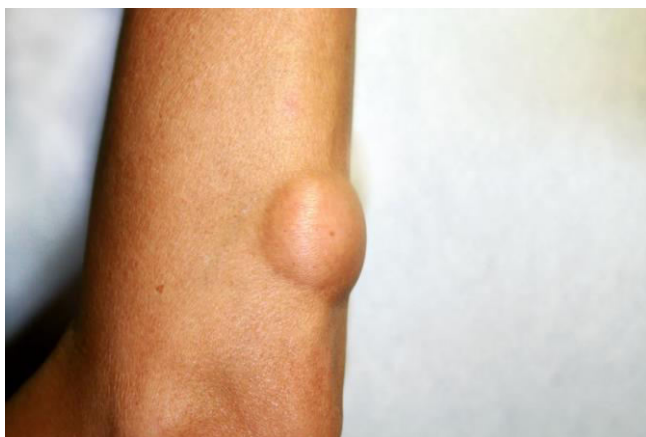
Tumour induced by dye wastewater

Textile wastewater constitutes a large number of chemicals like acids, bases, salts, dispersants, etc. and most importantly dyes that altogether are responsible for high biological oxygen demand (BOD), chemical oxygen demand (COD) and total organic carbon (TOC). Dyes therefore are one of the most important constituents of the textile industry and are major pollutants of water reservoirs.[5]