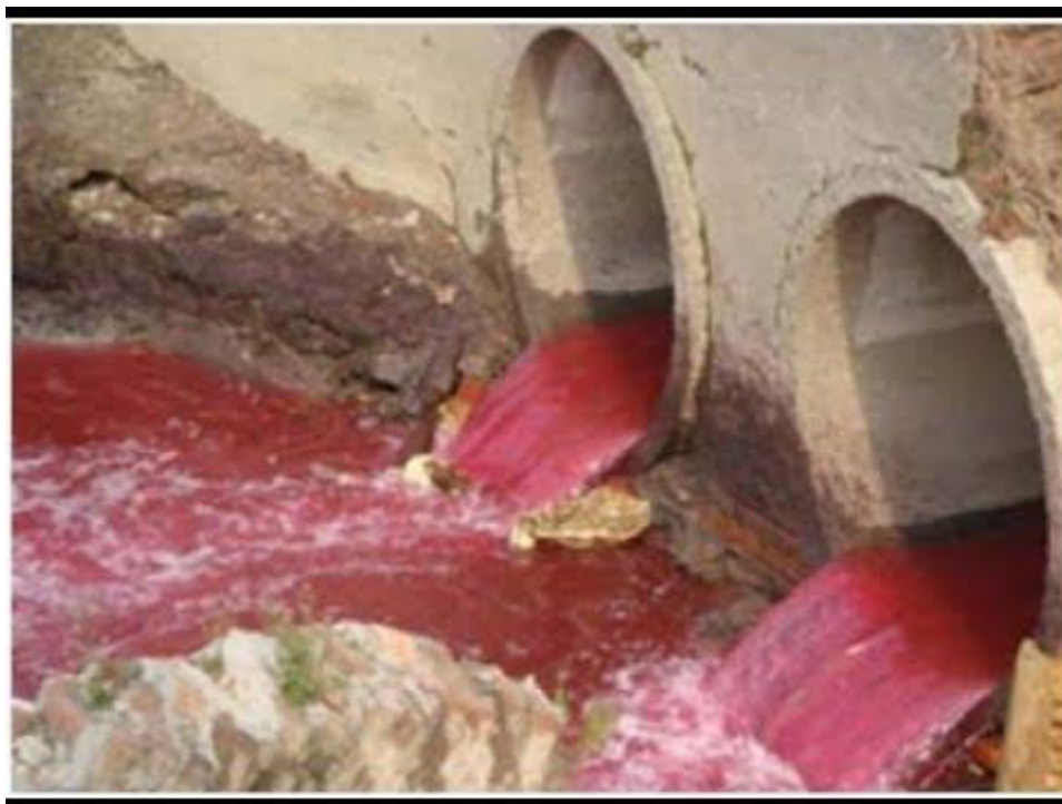
Textile Industry dye wastewater

In general, the diseases provided by textile dyes comprise from dermatitis to disorders of the central nervous system or may be related to the substitution of enzymatic cofactors that result in the inactivation of the enzymatic activities themselves. The acute toxicity to textile dyes is caused by oral ingestion and inhalation, especially by exposure to dust triggering irritations to the skin and eyes. The workers who produce or handle reactive dyes may have contact dermatitis, allergic conjunctivitis, rhinitis, occupational asthma or other allergic reactions. The latter are the result of the formation of a conjugate between human serum albumin and the reactive dye, which acts as an antigen producing immunoglobulin E (IgE) antibodies, which combine with histamine. Some dyes reveal mutagenic potentiality. The textile dyes may offer carcinogenicity, especially those of the azo and nitro type, and its effects manifest themselves over time. In humans, dyes are capable of generating chemical cystitis, irritation of the skin and digestive tract, respiratory and renal failure, among others.[4]