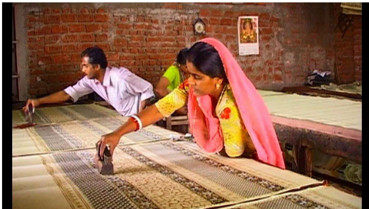
Sanganer handblock printing

The isolation of aerobic bacterial strains capable of degrading different dyes has been carried out for more than two decades. Biodegradation of the dye by certain groups of fungi during dye removal has been extensively demonstrated. Ligninolytic enzymes secreted by white rot fungi bind non-specifically to the substrate and therefore can degrade a wide variety of recalcitrant compounds and even complex mixtures of pollutants including dyes.[2]