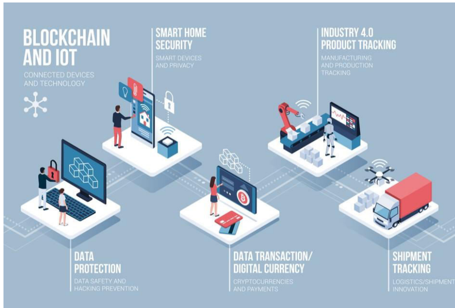
Figure 1. Blockchain and IoT

As the name Internet of Things, devices that are always connected to internet. So, if the devices lack security, they are vulnerable to virus and malware attacks and the control over the devices may be lost.