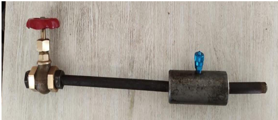
Fig 4.1 Vortex Tube

A steel cylinder is taken and is cut into two pieces. Both cylinders are bored separately as per the dimensions shown in design of vortex chamber. A nozzle of diameter 6mm is placed between the two cylinder and then welded. Now the welded cylinder with tangential nozzle is turned in lathe machine. M16 thread of pitch 1.25 is made internally in both the hole ( i.e. one hole is for joining hot tube and another hole is for joining cold end) of the vortex chamber. Vortex chamber. Air from compressor enters the vortex tube through 8mm house. Two thermocouple are placed at the two outlets of vortex tube. These thermocouples are connected to digital temperature indicator. Hot and cold end temperatures can be measured using these thermocouples. Inlet pressure can be measured pressure gauge which is fixed at compressor's outlet. The velocity of air coming out from both ends can be measured by anemometer. The hot end temperature, cold end temperature and velocity can be measured using thermocouple and anemometer respectively and the readings are tabulated.