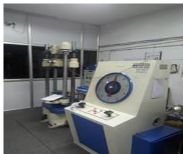
Figure 1 Tensile testing Process

Tensile testing, also known as tension testing,[1] is a fundamental materials science and engineering test in which a sample is subjected to a controlled tension until failure. Properties that are directly measured via a tensile test are ultimate tensile strength, breaking strength, maximum elongation and reduction in area.[2] From these measurements the following properties can also be determined: Young's modulus, Poisson's ratio, yield strength, and strain-hardening characteristics.[3] Uniaxial tensile testing is the most commonly used for obtaining the mechanical characteristics of isotropic materials. Some materials use biaxial tensile testing. The main difference between these testing machines being how load is applied on the materials.