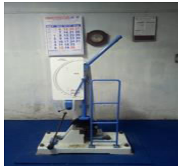
Figure 3 Impact Process

Impact testing of metals is performed to determine the impact resistance or toughness of materials by calculating the amount of energy absorbed during fracture. The impact test is performed at various temperatures to uncover any effects on impact energy.