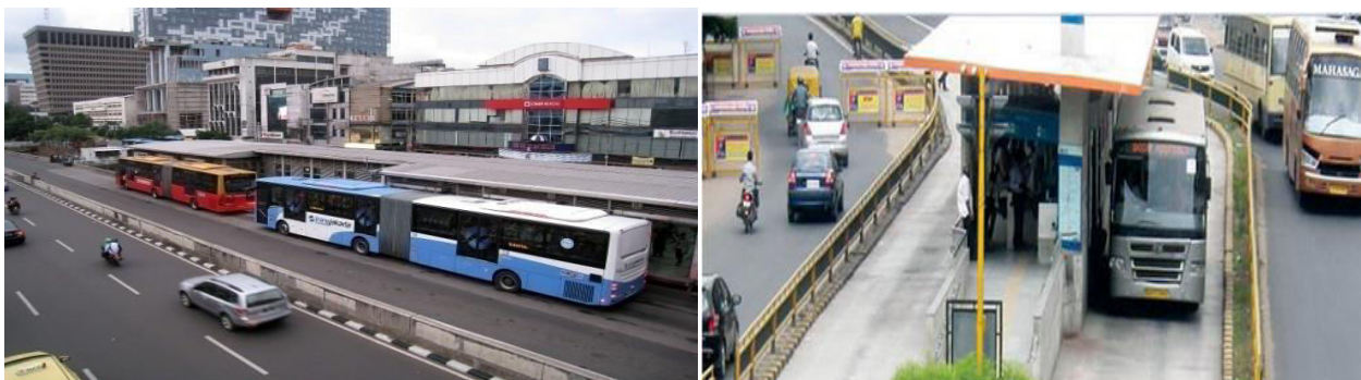
Fig .No.2: Bus Rapid Transit System

BRT systems is an innovative, high capacity, lower cost public transit solution. this System also increases efficiency and safety of public transportation systems and offer users greater access to information on system operations.