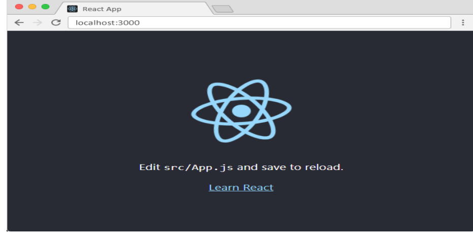
Figure7: Illustration of step 4(g)

g) Your React App has been created. Figure 7 illustrates step 4(g).