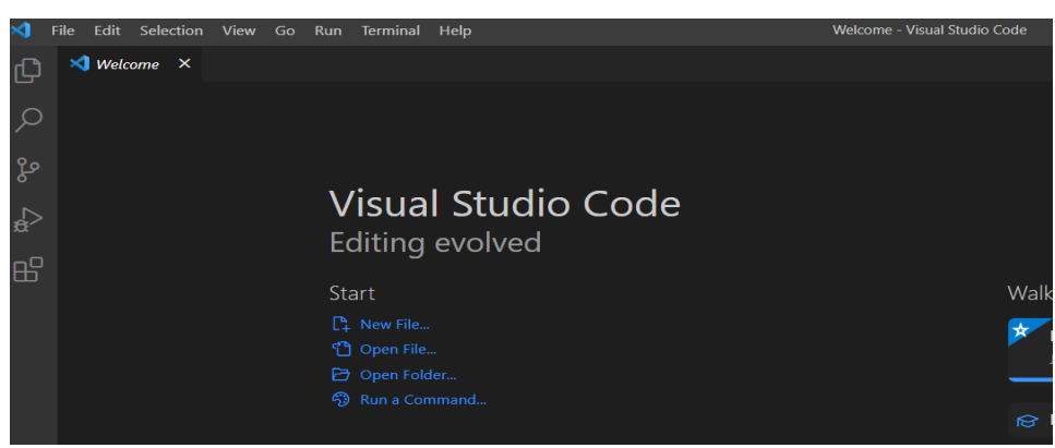
Figure4: Illustration of step 4(d)

e) Select the Terminal option and then New Terminal from the menu bar. Figure 5 illustrates step 4(e).