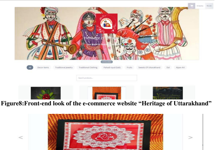
Alpan painting - $250,00 Alpan art is an established-ritualistic folk art originating from Kumaon in the formation filmalayas, Practitioners believe that it invokes a divine power which brings about good fortune and deters evil.

The websitedevelopment process of the e-commerce site was done using React as well as Commerce JS. First the look of the website was designed which included the navigation bar, the placement of product items, their details & categories and the name and logo of the website. Next the e-commerce functionalities were integrated into the website, which consisted on installing and configuring the required plugins for adding items to cart and checkout. The front-end look of the e-commerce website "Heritage of Uttarakhand" is shown in figure 8. Figure 9 shows the details of the product the price and pictures of the product. Figure 10 shows what items are present in the cart and other details. Figure 11 shows the address form for checkout. Figure 12 shows the payment form for checkout. Figure 13 shows the order details and id. An order confirmation mail is also sent to the customer's email id consisting of all the order details.