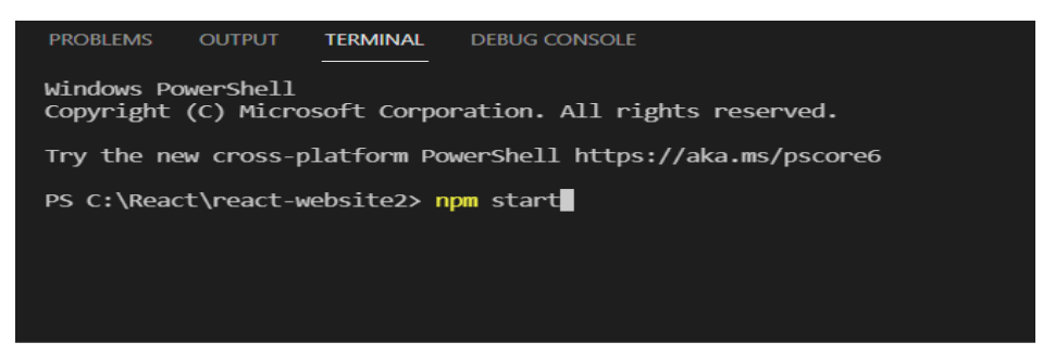
Figure6: Illustration of step 4(f)

f) Write code on the opened terminal npm start. Figure 6 illustrates step 4(f).