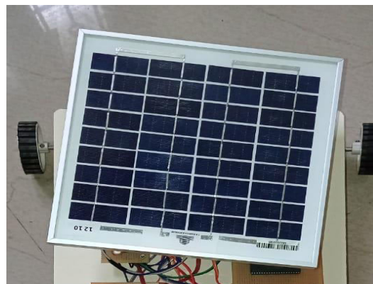
Figure 2 : Photovoltaic Cell

Photovoltaic solar panels absorb sunlight as a source of energy to generate electricity. Photovoltaic modules constitute the photovoltaic array of a photovoltaic system that generates and supplies solar electricity in commercial and residential applications. Photovoltaic modules use light energy (photons) from the Sun to generate electricity through the photovoltaic effect. The majority of modules use wafer-based crystalline silicon cells or thin-film cells. The structural (load carrying) member of a module can either be the top layer or the back layer. Cells must also be protected from mechanical damage and moisture. Most modules are rigid, but semi-flexible ones based on thin-film cells are also available. The cells must be connected electrically in series, one to another.