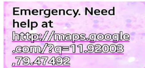
Figure No.5 : NOTIFICATION TO CARETAKER