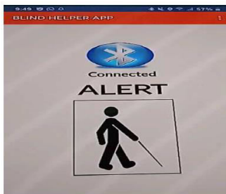
Figure No.4 : BLIND HELPER APP