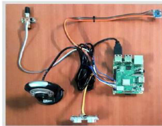
Figure No.2: Photo of the Proposed system

The proposed structure targets executing a perusing framework for visually impaired utilizing Python and Raspberry Pi. It does the going with limits, Image Capture, Convert to Text and Convert to voice. Measure the distance between the person and object. Fall detection sending notification to the caretaker's mobile number along with the location using GPS from GSM. This project acts like a virtual eye to blind people. It helps them in emergency.