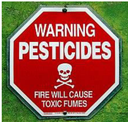
A sign warning about potential pesticide exposure

Pesticides may cause acute and delayed health effects in people who are exposed. [45] Pesticide exposure can cause a variety of adverse health effects, ranging from simple irritation of the skin and eyes to more severe effects such as affecting the nervous system, hearing, [46] mimicking hormones causing reproductive problems, and also causing cancer. [47] A 2007 systematic review found that "most studies on non-Hodgkin lymphoma and leukemia showed positive associations with pesticide exposure" and thus concluded that cosmetic use of pesticides should be decreased. [48] There is substantial evidence of associations between organophosphate insecticide exposures and neurobehavioral alterations. [49][50][51][52] Limited evidence also exists for other negative outcomes from pesticide exposure including neurological, birth defects, and fetal death. [53] when added in soil and water of district Ganganagar, Rajasthan