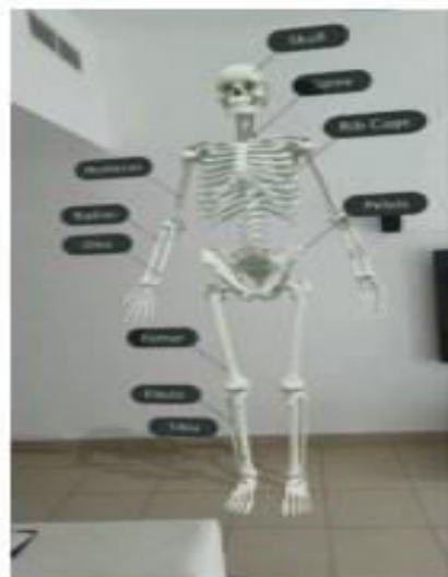
Fig 2. Augmented reality