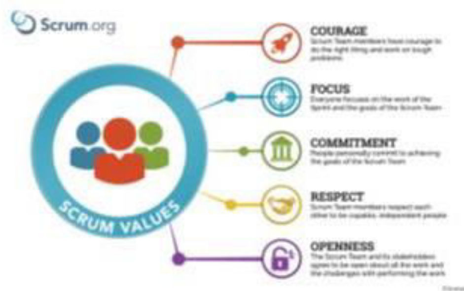
Figure 2: Values of Scrum Methodology [28]