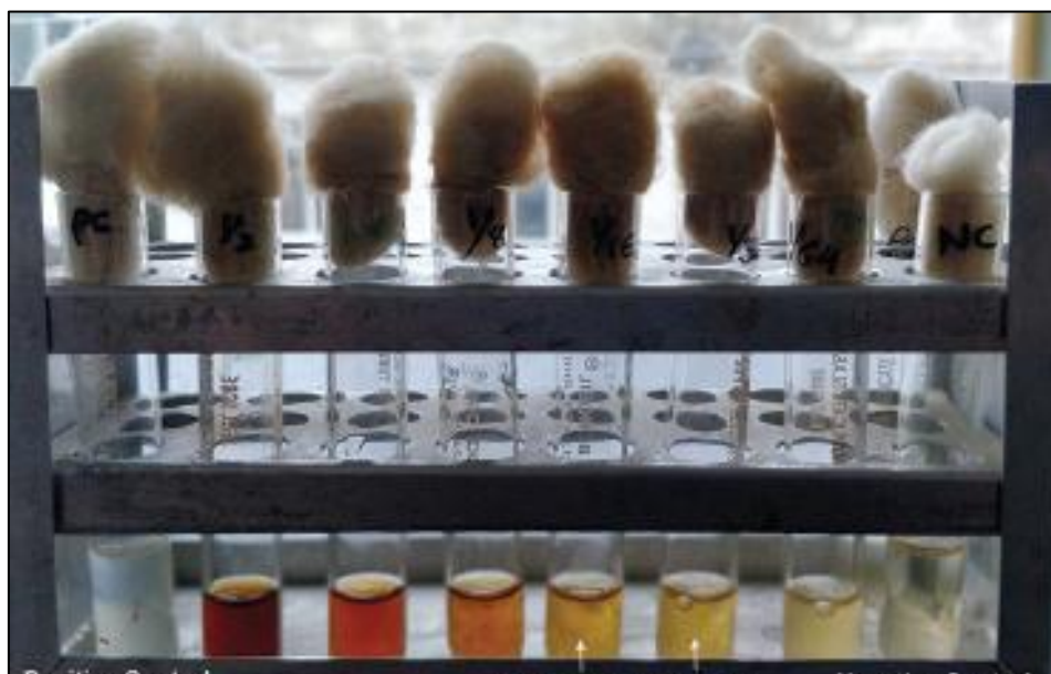
Figure 1 – MIC of Green Tea Extract against P. aeruginosa showing MIC value of 12.5 \mu g/mL which shows no turbidity whereas 6.25 \mu g/mL showing the turbidity with Positive control at left end and Negative (un-inoculated) control at right end.