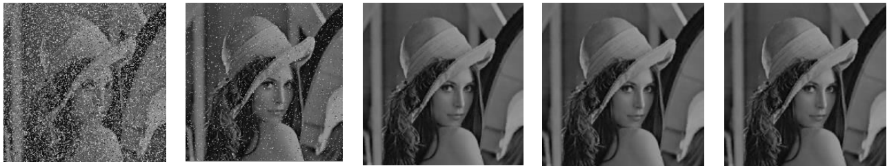
TSAMFT ITSAMFT Level-1 ITSAMFT Level-2 EETSAMFT FETSAMFT