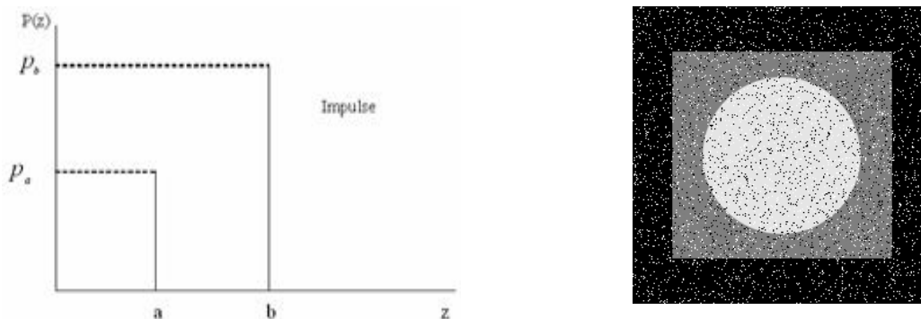
Figure 1. a) PDF of the Impulse noise b) Image affected by Salt and Pepper Noise

As shown below in affected salt and pepper noise image, if a > b , gray-level 'a' appears as a light dot in the image. Conversely, level 'b' appears like a dark dot. If either p_a or p_b is zero, the impulse noise is called unipolar.