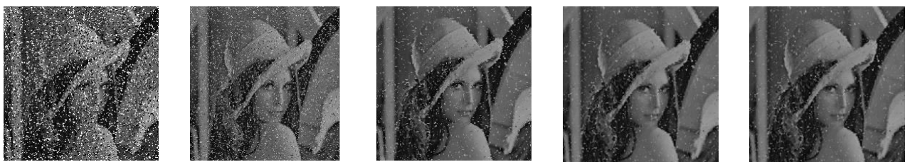
TSAMFT ITSAMFT Level-1 ITSAMFT Level-2 EETSAMFT FETSAMFT