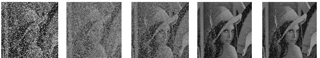
TSAMFT ITSAMFT Level-1 ITSAMFT Level-2 EETSAMFT FETSAMFT