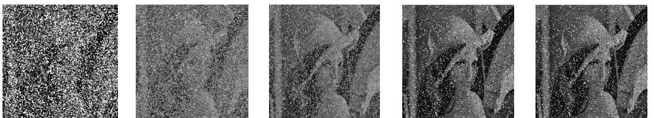
TSAMFT ITSAMFT Level-1 ITSAMFT Level-2 EETSAMFT FETSAMFT