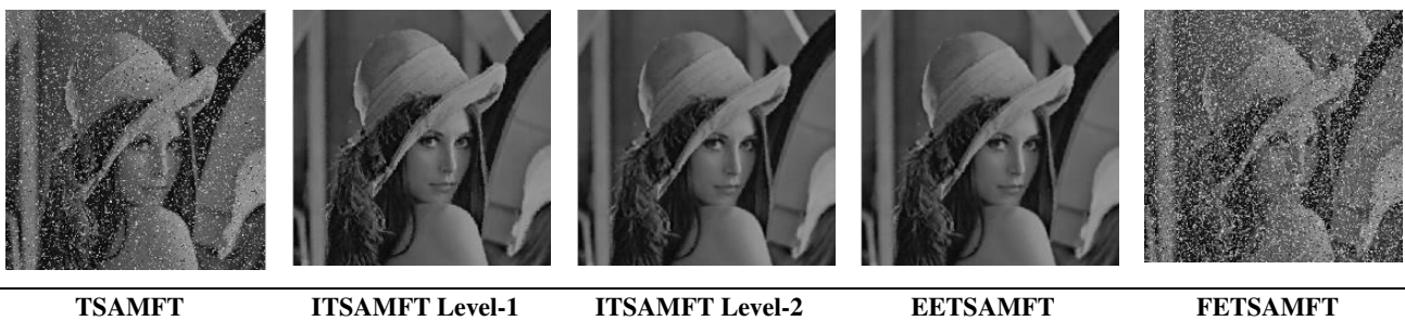
Fig.4 Shows computed images for noise density level 60%