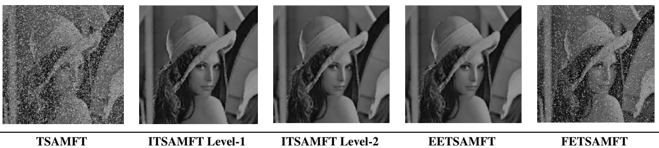
Fig.5 Shows computed images for noise density level 70%