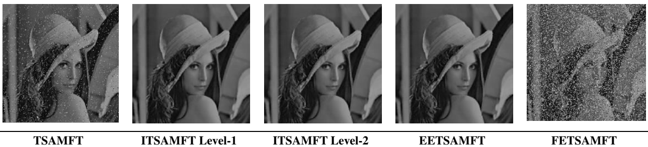
Fig.3 Shows computed images for noise density level 50%