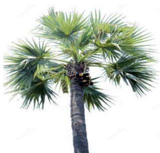
Fig 1.1 Palmyra palm

Palmyra tree fruit are economically useful and widely cultivated, mostly in South Asia and Southeast Asia.