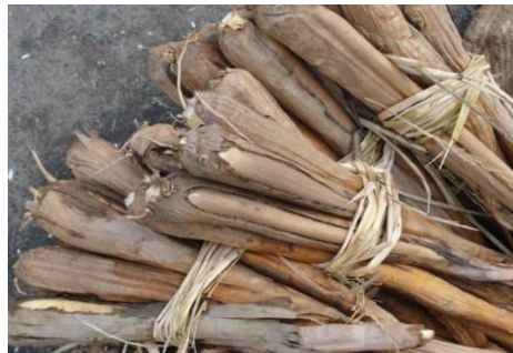
Fig 4.1.1 Palmyra tuber

Palmyra sprout (also known as Palmyra tuber) is an underground sprout of the Palmyra palm or Borassus flabellifer . It can be dried or boiled to a hard chewable snack.