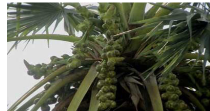
Fig 1.4.2. Palmyra female inflorescence