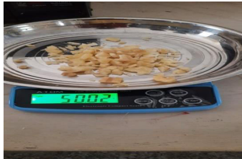
Fig. 4.3.1 Cutted pieces of Palmyra tuber

Burr mills are used for crushing of grains into flour. The burr mill has two roughened cast iron plates. One stationary and another one is rotate able. So the grains are fully crushed and sheared.