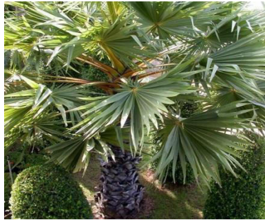
Fig 1.2 Palmyra leaf