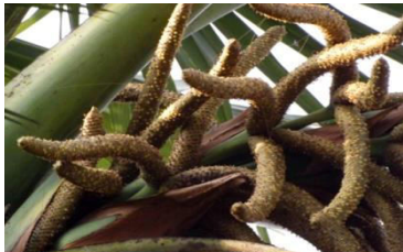
Fig 1.4.1. Palmyra male inflorescence

Inflorescences are interfoliar; the male inflorescence has stout terete branches, while the female inflorescences are more sparingly branched.