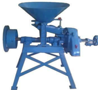
Fig 4.3.2 Burr Mill