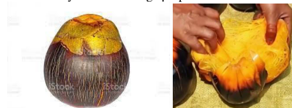
Fig 1.6 Palmyra palm fruit

Fruits are semi-globose to globose and deep brown to black when ripe. The palmyra palm ( Borassus flabellifer Linn.) fruit is one of the less known tropical fruits. The coconut-like fruits are three-sided or two-sided or three-sided when young, rounded or more or less oval, 12-15 cm wide and capped at the base with overlapping sepals. The outer covering of the fruit is smooth, thin, leathery and brown, turning nearly black after harvest. Inside is like a juicy mass of long, white fibres coated with yellow or orange pulp.