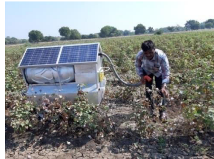
Field trial of cotton boll picking machine