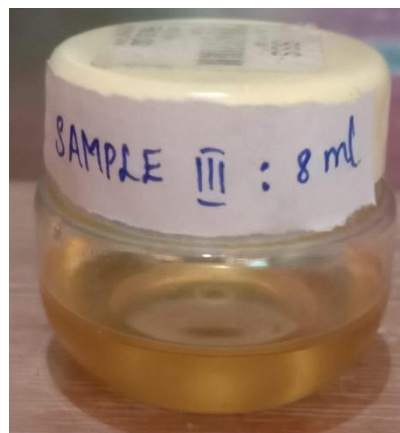
Figure 3: Oil extracted from Sample III