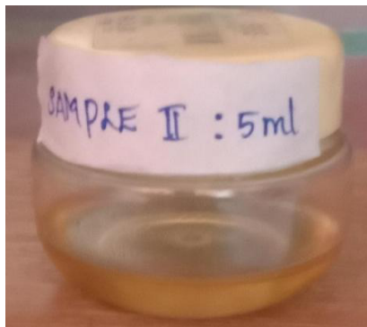
Figure 2: Oil extracted from Sample II