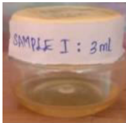
Figure 1: Oil extracted from Sample I