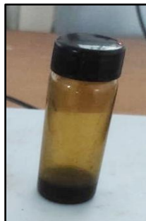
Figure 3: Citrus limtta