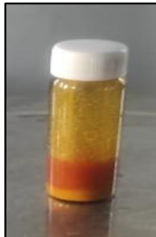
Figure 2: Citrus Sinensis