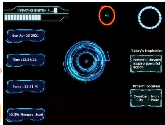
(b) GUI of Virtual Assistant