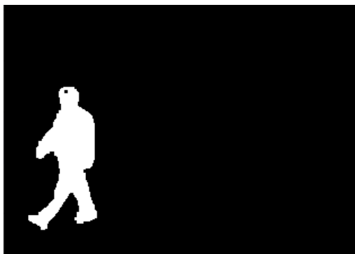
Figure 4.1.2: Silhouette of 45° angle Image