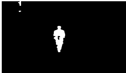
Figure 4.1.1: Silhouette of 90° angle Image