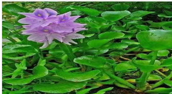
Fig.2 Eichhornia Crassipes

It is also known as common water hyacinth, is an aquatic plant native to the amazon basin, A nd is often to highly problematic invasive species outside its native range. The three commonl y used control methods against water hyacinth infestations are physical, chemical and biological controls. The roots of Eichhornia crassipes naturally absorb pollutants, including lead, mer cury, and strontium-90, as well as some organic compounds believed to be carcinogenic, in co ncentrations 10,000 times that in the surrounding water. Water hyacinths can be cultivated for waste water treatment. To reduce the impurities from the water.