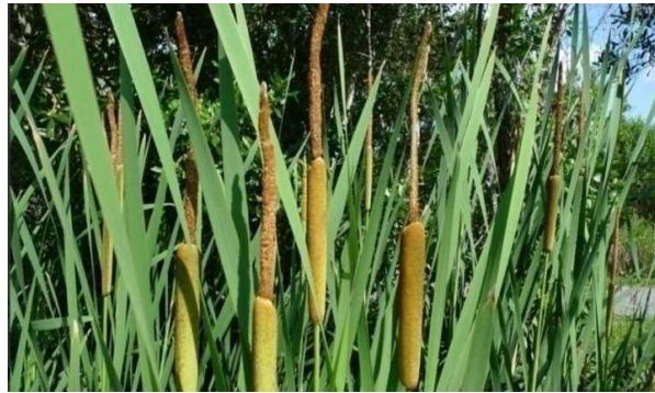
Fig.1 Typhas Plant

The typhas are aquatic or semi aquatic, rhizomatous, herbaceous perennial plants. Typhas are often the among the first wetland plants to colonize area of newly expose wet mud. It absorb the impurities from the water, its Major role to absorb Nutrients from the wastewater.