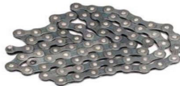
Fig shows the chain

A bicycle chain is a roller chain that transfers power from the pedals to the drive-wheel of a bicycle, thus propelling it. Most bicycle chains are made from plain carbon or alloy steel, but some are nickel-plated to prevent rust, or simply for aesthetic Bicycle chain can be very energy efficient: one study reported efficiencies as high as 98.6%.