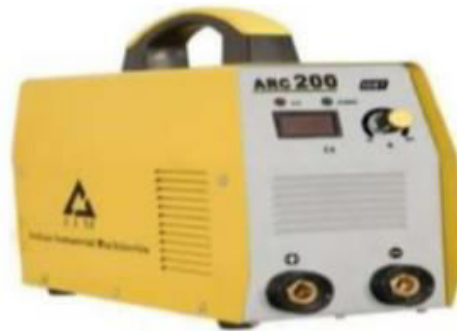
Fig 4.2. Welding Machine