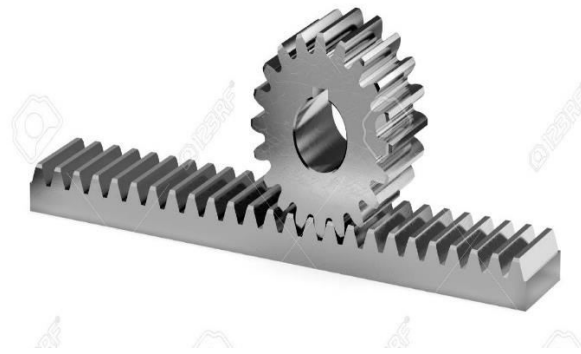
Fig 6. Rack And Pinion

Rack and pinion is a type of gear converts rotational motion into linear motion.It may have straight teeth or helical teeth .Helical teeth are mostly preferred due to higher load bearing capacity.