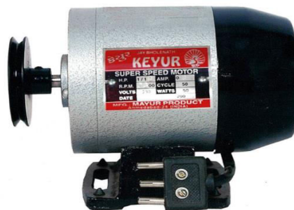
Fig 4.3.Ac Motor

Ac Motor is an electric motor driven by alternating current(AC).The rotor magnetic field may be produce by permanent magnet.motor enclosure also protect from moisture and containment.