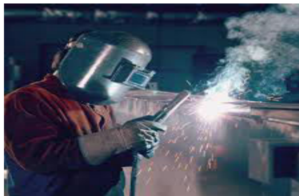
Fig2.1. Welding operation using manual welding machine

This figure shows that the industries are using manual welding machines to weld workpieces or jobs and due to this the quality of weld and the speed of weld cannot be insured. Also there is a risk to form hazards to the workers.