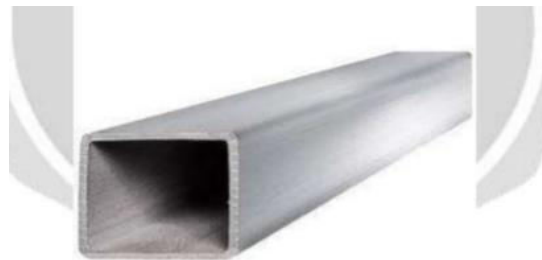
Fig 4.1. Metal Frame

The metal frame is made of mild steel .It is suitable for slightly stressed component. It is available in round square etc. Shape.It is suitable for machining allowance.it also closes dimentional tolerance.