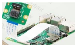
Fig 4: pi camera