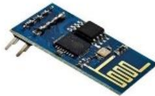
Fig 7: WiFi module