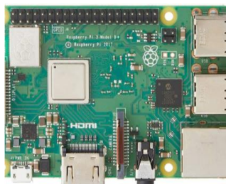
Fig1: Raspberrypi 3