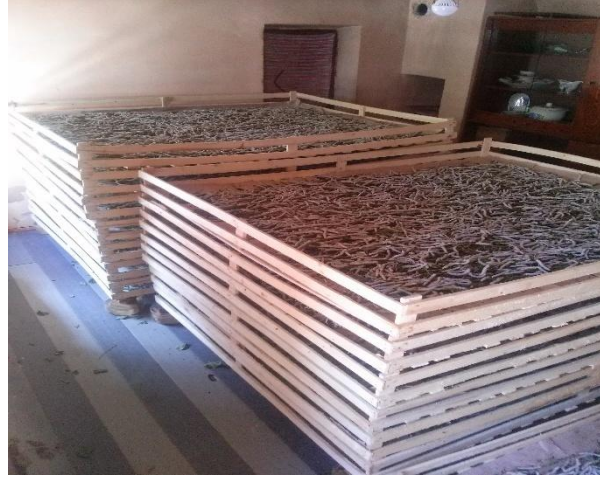
Picture-2. Feeding silkworms in boxes.

And finally, as the boiler area is reduced, the fuel consumption to heat it is also reduced by 2-8 times.