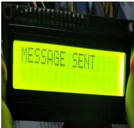
FIG 3: LCD output after sending message