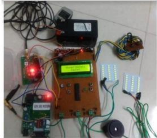
FIG 2: When panic button pressed